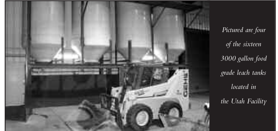
Pictured are four of the sixteen 3000 gallon food grade leach tanks located in the Utah Facility

plant minerals available today. This comprehensive blend of plant minerals provides incredible nutritional benefit when used in food supplements or in formulations of processed foods. These minerals also blend very well with animal feeds to enhance nutritional value beyond anything imaginable! They contribute significantly to plant growth and increased nutritional value when used in minute amounts as fertilizer or foliate.